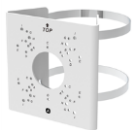
SN-CBK627D Pole Mount